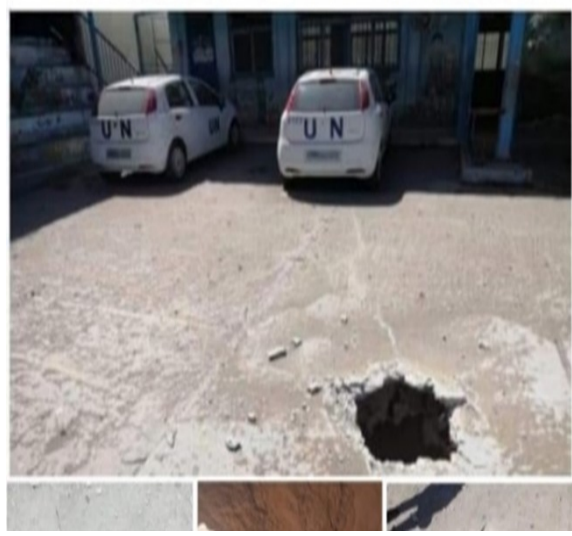
Figure 8: Post by "Israel speaks Arabic" utilizing a lying strategy. The image discusses an Israeli bombing of a school by accusing Hamas of endangering the lives of students in Gaza. It writes, "Hamas tunnels have turned school students into human shields! .... This is one of the tunnels that Hamas is investing to serve Iran in its terrorist project at the expense of the children of Gaza."