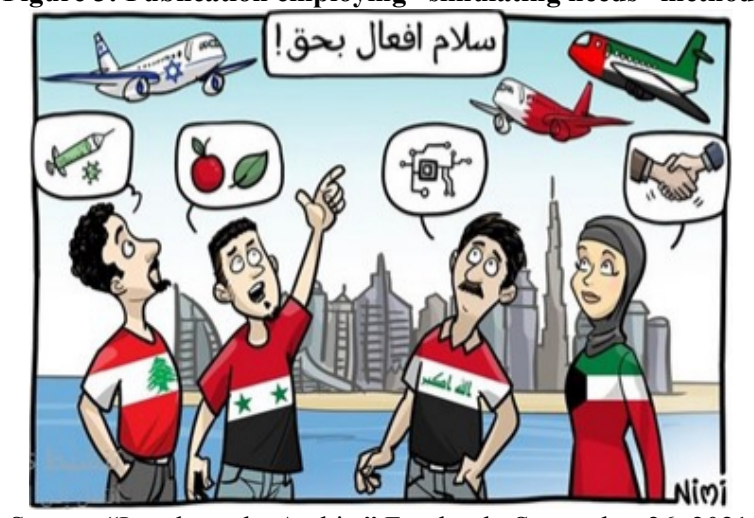
Figure 3: Publication employing "simulating needs" method

In September, the page published a post showing the importance of peace with Israel and its role in achieving prosperity for the Arab world. The post featured a cartoon of four youths wearing T-shirts with the flags of Arab countries, namely Lebanon, Syria, Iraq, and Qatar. They look up at the sky, where planes from Bahrain and the Emirates are heading to Israel. The accompanying text reads, "Dozens of agreements in one year... More than a trillion dollars in a decade... Millions of young people in the region will benefit from peace outcomes in various fields." Publications such as these aim to influence the Arab youth and push them towards accepting Israel and achieving peace with it on the premise that this will lead to the advancement of the Arab peoples and prosperity for their youth (Figure 3). 52