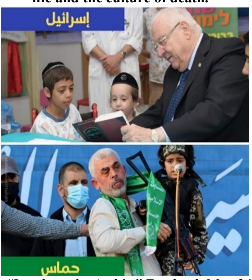
Figure 12: A publication utilizing suggestive language; "The difference between the culture of life and the culture of death."

Source: "Israel speaks Arabic," Facebook May 26, 2021