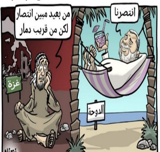
Figure 11: Post using the "Warning, inciting and accusation strategy." A Hamas leader vacations in Qatar, enjoying his time, while talking on the phone about the victory of the resistance in Gaza. A person in Gaza, on the other half of the image, looks devastated and broken, and responds by saying, "We won from the inside, but we've lost in reality."

Source: "Israel speaks Arabic," Facebook, May 22, 2021