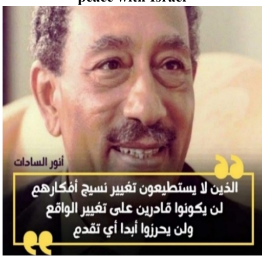
Figure 6: Quoting the late Egyptian president Anwar Sadat, who was known for his support of peace with Israel