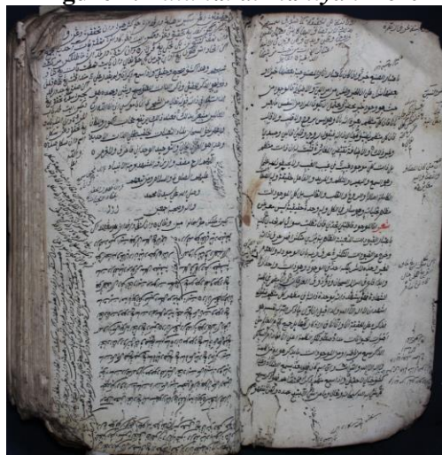
Figure 2. Futuhāt al-Ilāhiyah Text

Texts about the teachings of the Martabat Tujuh are very much found in Minangkabau, in addition to text copies of the ideas of previous scholars such as Sheikh Abdurrauf, Sheikh Syamsuddin Sumatera, and Hamzah Fansuri, there are texts containing local thoughts related to the Martabat Tujuh . This can be known from several texts regarding the teachings of the Martabat Tujuh that have different ways and analogies in explaining the essence of the teaching.