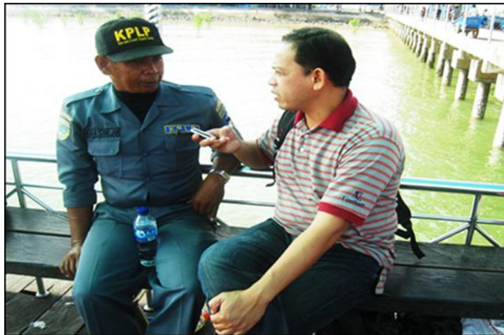
Figure 2: In-depth Interview with an Indonesian Coast and Sea Guard Unit Officer ( Kepala Penjagaan Laut Pantai Indonesia ) at Nunukan

A detailed interview with an official from the Indonesian Coast and Sea Guard Unit ( Kepala Penjagaan Laut Pantai Indonesia ) (Figure 2) shows that at least eight illegal routes known as ' lorong tikus ' (rat trails) were often used for illegal trafficking of the migrant workers into Sabah. The dangerous routes are taken by illegal taikong laut (sea taikong ) using speedboats through mangroves at night-time made it impossible for authorities to detect their movement. Figure 3 shows that there were two trails through Sungai Nyamuk, Pulau Sebatik; three trails through Kalabakan in Tawau; two trails through Sungai Ular, Simengaris in North Kalimantan; and another through Sungai Serudung in Tawau. It was informed that there were 50 more illegal routes in East and West Kalimantan used by taikongdarat (land taikong ) to transport migrants in the dark of night. Taikong Kerja (work taikong ) received migrant workers and brought them to employers. This established networking system sustained illegal migration to Sabah.