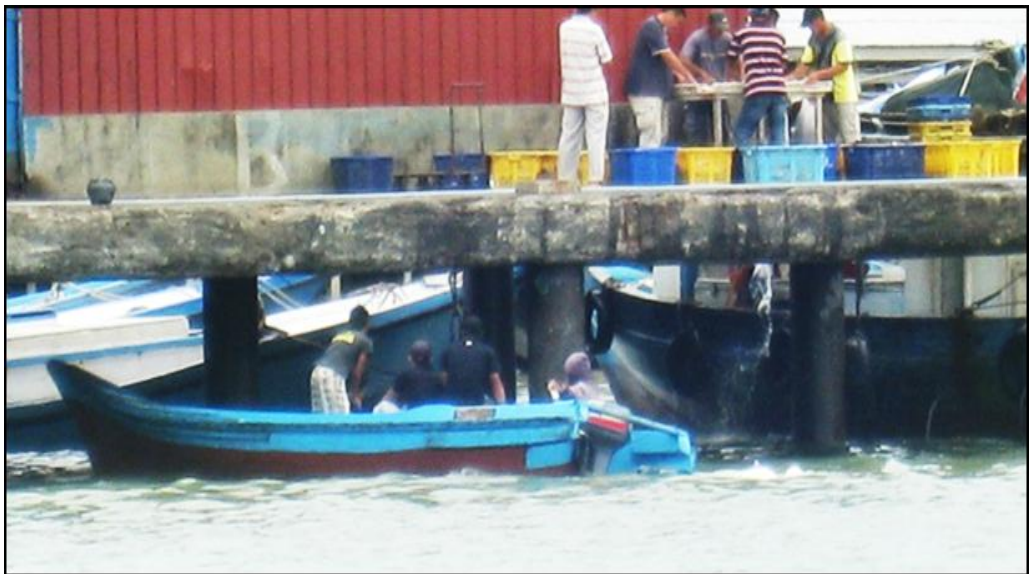
Figure 1: Speedboat from Sungai Nyamuk Arriving Near Tawau Port Transporting Illegal Migrants

It was informed that some mandors return to their villages, identify and select potential workers mostly from their relatives and friends, and then travel back together to Nunukan Sabah. Mandors sought assistance from the boat owners ( calo/taikong laut ) to avoid the high costs of obtaining legal travel documents and work permits. They were often their friends and relatives (Figure 1); they helped them to cross the Malaysian border unauthorised from Sungai Nyamuk in Pulau Sebatik.