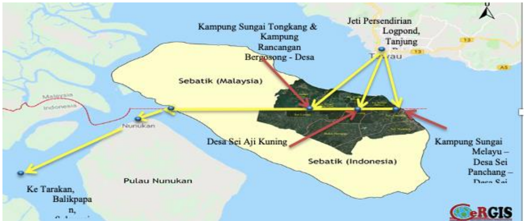
Map 2: Path Sketch of the Smokol Phenomenon

communities,' experience of placing researchers as actors' informal cross-border trade and 'understanding access to routes trade'.