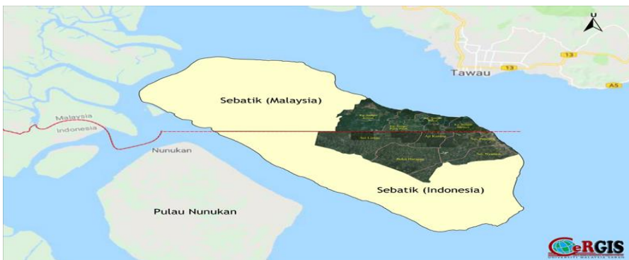
Map 1: Sebatik Island Malaysia-Indonesia

Sabah is one of the thirteen states in Malaysia, located in the Borneo archipelago. Strategically, the position of this region shares a border between Brunei Darussalam, the Philippines, and the Republic of Indonesia. Sabah's position at the center of the geo-political system of the border leads to dynamism in terms of the continuity of borders and sovereignty of a country in general Malaysia and the state of Sabah in particular. This continuity invites a variety of scenarios and phenomena unique to relations between countries. The dominant factor to this boundary composition is the strategic position. For example, according to Ramli Dollah, Wan Shawaluddin Wan Hassan, Diana Peters, and Zaini Othman (2016), Sabah covers 72,689 km of land, excluding the land of the surrounding islands, which is estimated to be 1,549 km. While the maritime area covers 54,360 km, making up 30 percent of the Economic Exclusive Zone (EEZ). Ramli Dollah et al. (2016, p. 179) say that this maritime area is formed from the South China Sea in the west and the Sulu Sea in the north of Kudat, as well as extending to the east coast region, which includes the Sulu Sea, and the Celebes Sea in the districts of Semporna and Tawau.