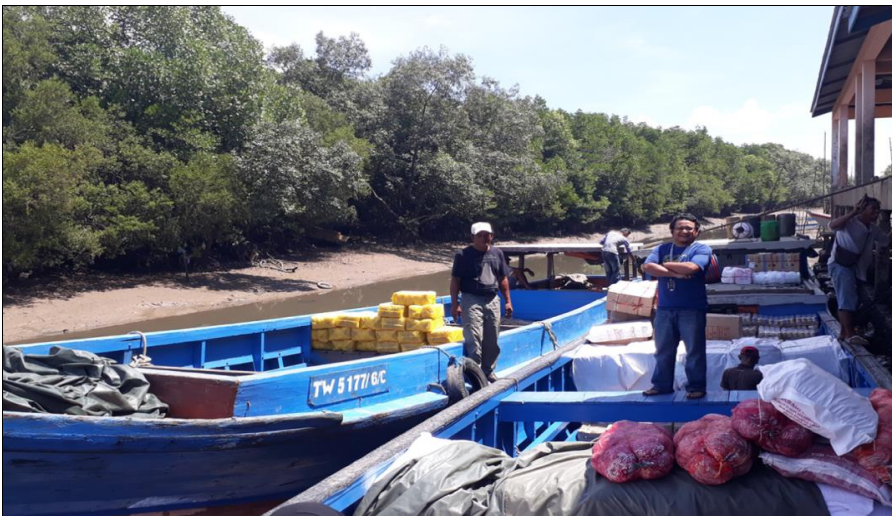
Figure 1: Researchers with informants perform ma'passoko activities (unloading of merchandise) and handle Jongkong to be sent to Kampung Sungai Melayu - Desa Sei Panchang Pulau Sebatik