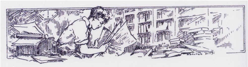
Figure 7: Abdullah Ariff, “Perpustakaan”, Suara Malaysia , 1 Jun 1939

The vignettes he produced for Suara Malaysia are interesting as well. His rendition for “Perpustakaan” (Figure 7) for example, portrays a boy reading newspaper while facing arrays of books with the library in the background. On the left of the image is a typewriter with papers slotted in, reading to be typed. The association of knowledge to the idea of worldliness seems to be persistent in such works – be it reading books, communication symbols that could be seen in the rendition of letters and typewriter, transportations like airplanes and ship – the work of Abdullah Ariff also testifies that he is a knowledgeable person and who profess his worldliness.