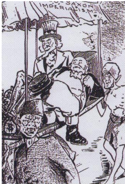
Figure 8: Abdullah Ariff, “Anglo-Saxon Imperialism”, Penang Daily News , 9 September 1942