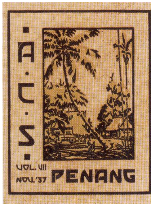
Figure 2: ACS Magazine, November 1937, 11 x 16 cm