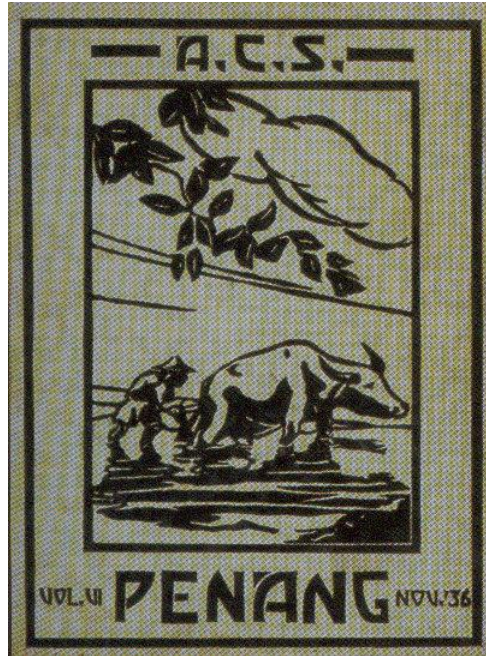
Figure 1: ACS Magazine, November 1936, 23.6 x 17.2 cm