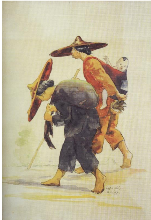
Figure 11: Abdullah Ariff, “Two Chinese Women” (c. the 1930s), watercolour, 28 x 20.7 cm