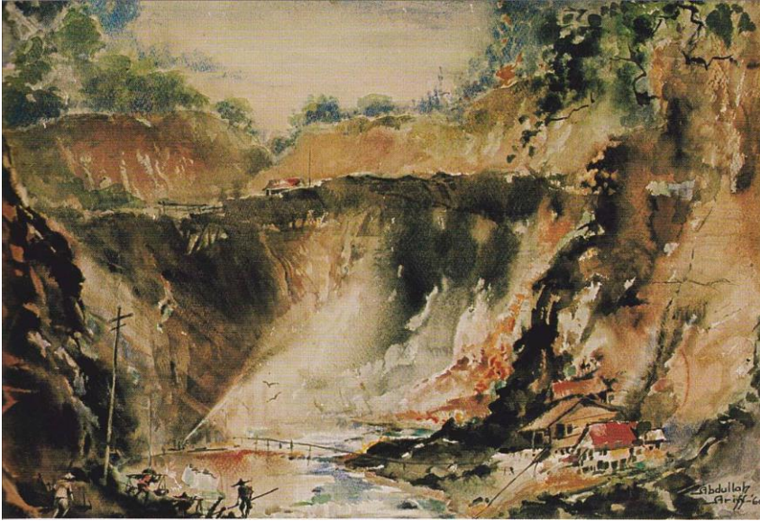
Figure 12: Abdullah Ariff, “Bumi Yang Bahagia Lombong Bijih Timah Malaya” (1960), watercolour on paper, 60.0cm x 75.5 cm (Source: Zakaria Ali [2004].)

The tin industry was the major pillar of the Malaysian economy during the late colonial to early independence period. The scene of tin mine is captured with warm colour scheme with the schematic of the foreground, middle ground and background created a recessive form of depth and space. With the angle perspective that the artist applied in this painting, it gives a wide and magnificent feel to the viewer that could also be seen as an artistic documentation of the economic activities of the country and yet the precision of Abdullah Ariff’s rendition came to the extent that the image of the three workers was drawn at the bottom left of the painting.