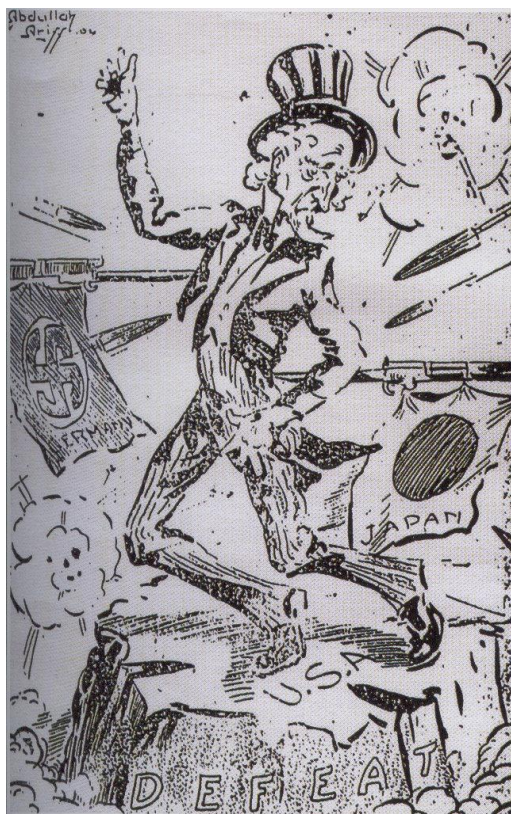
Figure 9: “No Way to Escape”, Penang Daily News , 9 October 1942

On top of that, the various caricatures that he did for Penang Daily News also reflected his worldly knowledge of international politics. For example, in “Anglo Saxon Imperialism” (Figure 8), characters such as Uncle Sam and Winston Churchill are seated on a carriage, carried by local figures, the man wearing the songkok , and the man wearing sarong and turban were carrying the carriage reflecting the imperialist ideas. Thus, as these works were for the Penang Daily News , the anti-Western stances are overt as could be seen in “No Way to Escape” (Figure 9). The Americans through the image of Abraham Lincoln as Uncle Sam, that is about to be stabbed by German and Japan bayonets. Perhaps similarly, Abdullah Ariff seems to reiterate Appiah’s observation that “..., the cosmopolitan patriot can entertain the possibility of a world in which everyone is a rooted cosmopolitan, with its cultural peculiarities, but taking pleasure of the presence of others, different places that are home to others, different places that are home to other different people” (Appiah 1997, p. 618) that he produced these images in local newspapers.